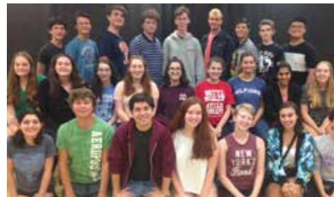
Cast of Radium Girls

Performances at Schreiber High School are Nov. 15-17 at 7:30pm, and Nov. 18 at 2pm. General Admission is $15, Student tickets are $10 and Senior Citizens are complimentary. Tickets can be purchased at the door. For more information, follow the Schreiber Theater Company on Facebook, Instagram and Twitter @SchreiberTheatreCompany.