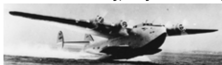
Pan Am’s Dixie Clipper taking off from Manhasset Bay heading to Bermuda or Europe between 1937 and 1940.

fascinating history of early Port Washington. Topics include the livelihoods that helped Port develop into the town you know today, including shell fishing, sand mining, aviation, tidal mills, restaurants, the many hotels and much more. Bring a bag lunch to enjoy at the north dock at the end of the tour.