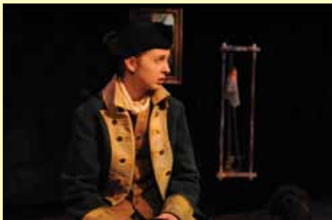
Port Washington Play Troupe presents two performances of Fair Liberty's Call: A Musical Story of Revolutionary America on Monday, July 9 and Friday, July 13.