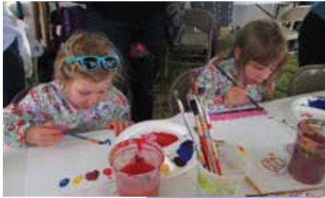
Young painters create masterpieces in The Art Guild's tent in Sunset Park.