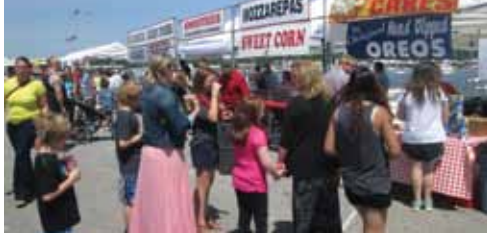
The HarborFest Food Court provides a wide range of delicious food choices.