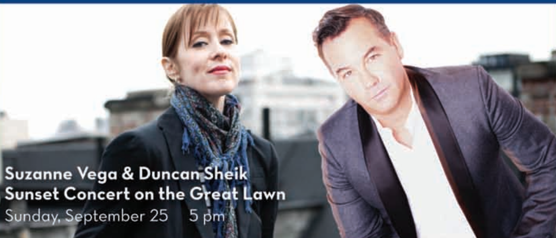
Suzanne Vega & Duncan Sheik Sunset Concert on the Great Lawn Sunday, September 25 5 pm