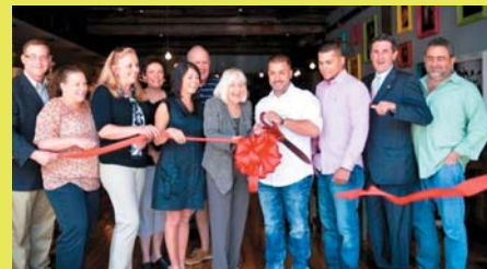
Port Chamber, GPW-BID and local dignitaries help celebrate Bareburger Ribbon Cutting. Bareburger, 42 Main Street

The Port Washington Calendar Likes to see new ventures, cleanups and refurbishing of our business district. Watch this space each month for the newest efforts to help make our retail business strong.