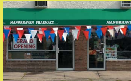
Manorhaven Pharmacy opens and shares space with the Manorhaven Market. 159 Manorhaven Boulevard