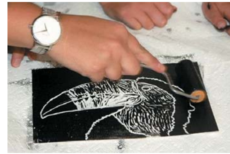
Simple printmaking for children at The Art Guild

The Art Guild of Port Washington is located at Nassau County's historic Elderfields Preserve, 200 Port Washington Blvd., Manhasset. For more information on CreARTive, classes, exhibits and more for all ages, visit their website www.theartguild.org , call 516-304-5797 or email info@theartguild.org .