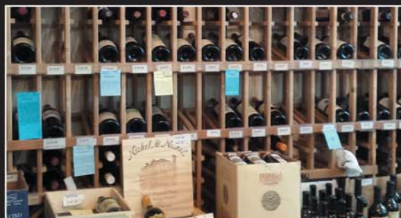
Visit our temperature controlled fine wine closet

We BEAT or MATCH Any Advertised Price In Nassau County (MUST BRING IN COMPETITIVE AD)