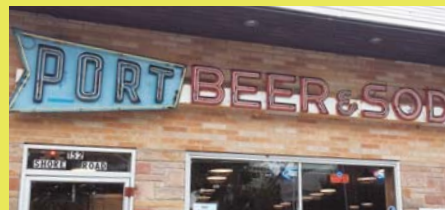
Port Beer & Soda has been refurbished and revitalized by new owners 152 Shore Road.