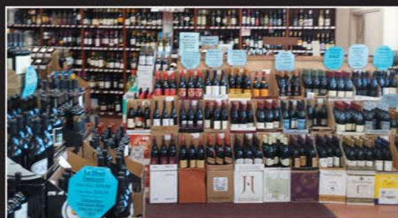
4000 Sq. Ft. stocked sales floor