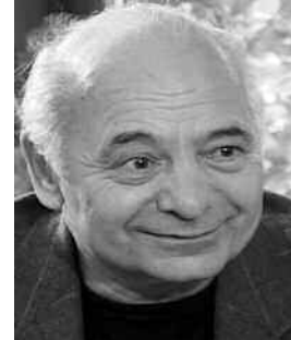
Actor, writer and director, Burt Young