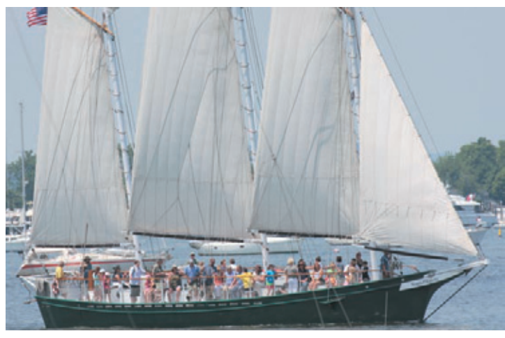
ADMIRAL SPONSORS Anton Community Newspapers, The Town of North Hempstead