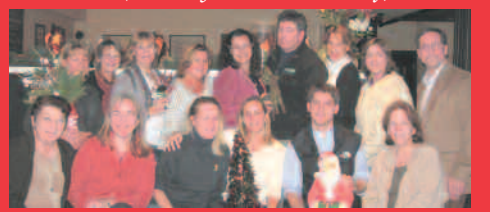
Christmas Tree Lighting Committee, 2012

Watch a live re-enactment of the Nativity, including our young angels followed by the singing of carols and the lighting of the tree.