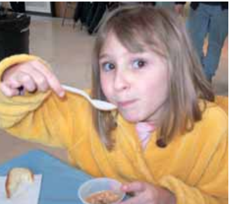
Try out delicious soups from local restaurants at Port Washington Chamber of Commerce's 4th annual SOUPer Bowl.

food establishments will be donating their best soups for the contest and hope to be voted Port Washington's 2011 SOUPer Bowl Champ. "Buy a Spoon" and become a "taster" to sample two ounces of each of the soups donated by the restaurants. Then vote for your favorite soups to determine the 2011 SOUPer Bowl