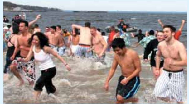
Brave participants in the 2009 Plunge. Brrrr!