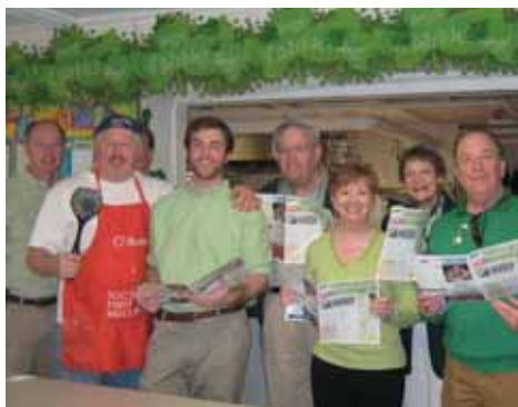
2009's happy Breakfast Committee

Hibernians' Pancake Breakfast Sun. March 14