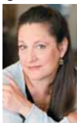
Jayne Anne Phillips

Registration brochures are available at the