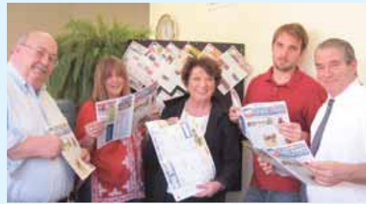
* Staff of the Port Washington Calendar, 403 Main St.

Loyal readers of the Port Washington Calendar of Events always know just where to be in town!*